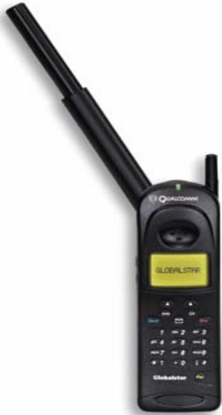
GSP 1600 portable satellite phone